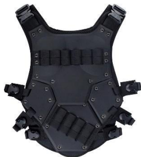
Ablative Hardweave: +6 Body

Physrep requires Visible Hard Plates on at least 50% of the armour piece.