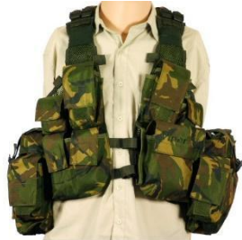
Tactical Vest: +2 Body