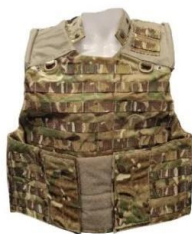
Plate Carrier: +4 Body

Physrep requires foam plates or similar padding.