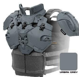
Future Warrior: + 8 Body.

Physrep requires Visible Hard Plates on at least 50% of the armour pieces.